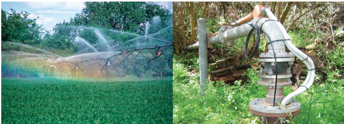
Gunmetal wafer type valve mounted between flanges